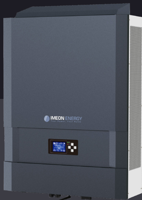
IMEON 9.12 Up to 12kWp Three phase