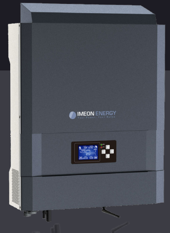
IMEON 3.6 Up to 4kWp Single phase