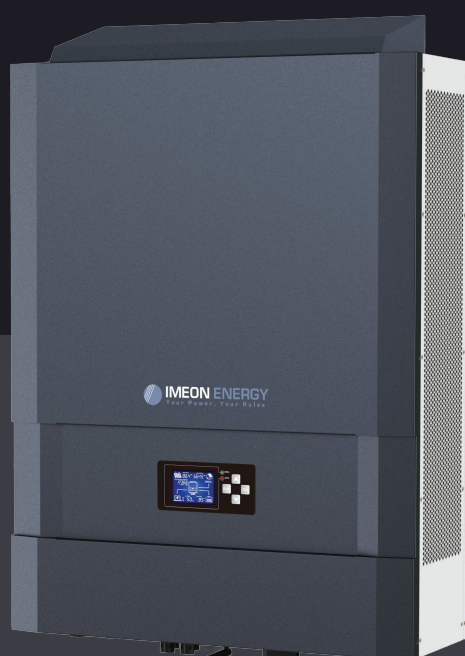
IMEON 9.12 Up to 12kWp Three