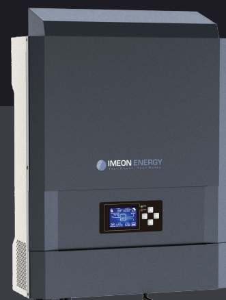
IMEON 3.6 Up to 4kWp Single